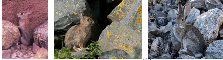
Eastern cottontail rabbit on rocky areas 133