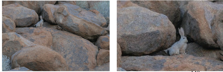
Pronolagus randensis in its original rocky habitat 140

associated with the hyrax and possibly share natural crevices in the rocks for shelter. 138 139