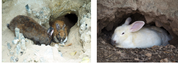
Rabbits in rocky holes

This is true of rabbits. Rabbits dwell in a variety of habitats, 124 125 ...[its] lifestyle in different habitats emphasizes the species’ marked adaptability . 126